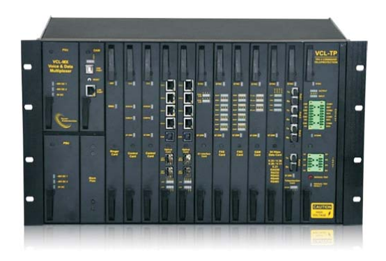
Front View - VCL-MX Version 6

VCL-MX Version 6 - 80 x E1 Multiplexer may be used for inter-connecting legacy voice and data networks, provisioning and managing bandwidth on a E1 channelized level as well as 64Kbps, DS-0 time-slot level and can be used as a digital-access cross-connect equipment. This solution also provides 4 x Binary (110VDC / 220VDC) Commands Teleprotection interface for providing Distance Protection and IEEE C37.94 optical (MM / SM) ports for providing Distance / Differential Protection.