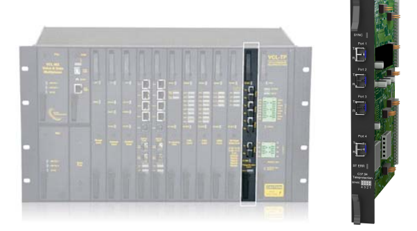
IEEE C37.94 Teleprotection Card

VCL-MX IEEE C37.94 interface card meets and complies with EMI, EMC, Surge and Temperature specifications making it suitable for sub-station installations to provide uninterrupted service even in the most demanding and harsh environments.