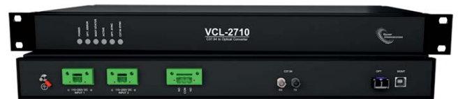
1U high, standard 19-inch Rack Mount Version